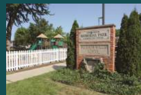
58 S. Wilson

Did you know? In our 4.2 square miles, we are privileged to have 12 public parcels in our park system (124 acres!)